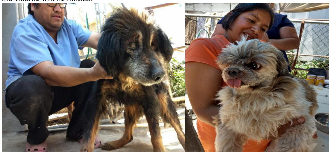
Charlie the Dog 2004-2019

There are times when we rescue animals that are so damaged physically or psychologically that they are not suitable to be adopted by persons who do not know how to cope with them. We are fortunate to have some rescuers who will take these animals, sometimes for the life of the animal, so that they can live out their life in a secure and loving environment. That was the case with Charlie. He was rescued by FHSTJ in 2008 from a "hoarder" who had him in a small cage for at least two years. He was malnourished, had a lot of muscle atrophy and extremely frightened. The vet estimated his age at that time to be about 4 years old. Since the time of his rescue, he remained with the same loving rescuer. FHSTJ has been providing Charlie and 25 other dogs like him with food, medicine, supplies and veterinary care. Charlie just passed away. He lived to the ripe old age of 15. Here is the last photo we have of Charlie with his care giver. He remained fairly healthy up until the last few days of his life. In spite of his advanced age he still wanted to stand and walk a bit. Charlie will be missed.