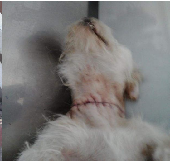
Felix at first post operative visit to the vet.

*Felix was found tied to a lamp post the morning of an FHSTJ street treatment event. Nobody claimed him. He was immediately taken for veterinary care using FHSTJ Treatment Certificates.