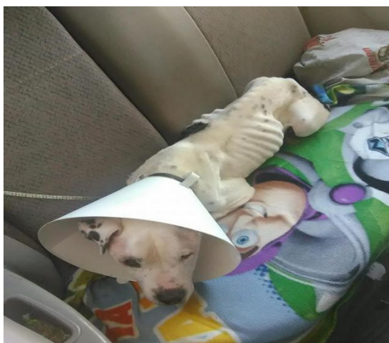
Diego rescued from abusive family. *

The following photos are not staged or done by professionals. They are the actual photos done by the rescuers receiving FHSTJ support.