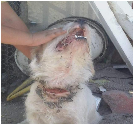
Felix found with ingrown collar and neck lesion.*