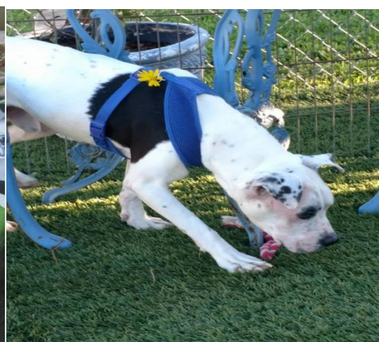
Diego after treatment -ready for adoption.

*Diego had been abandoned and left starving. He was ill, full of ticks and had skin lesions.