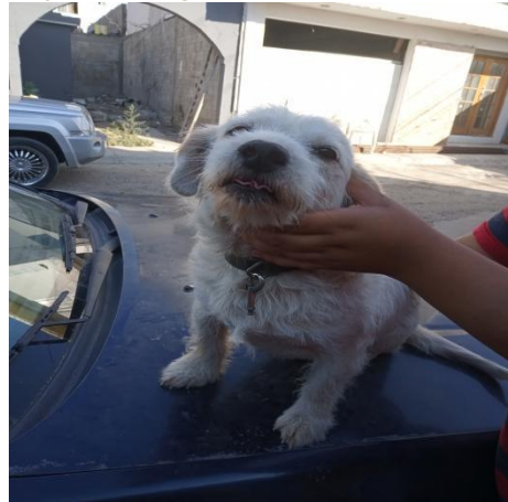
Felix found a forever home.