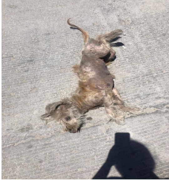
Molly-Tossed in street, left to die.*

*Molly had been tossed in the street and left to die. This first photo was taken by the rescuer at the moment she was found. You can see the shadow of the rescuer taking the photo.