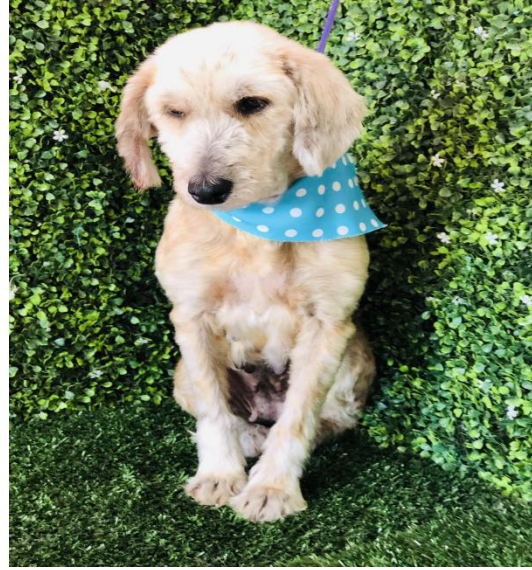
Molly- After treatment-ready for adoption.

*Molly had been tossed in the street and left to die. This first photo was taken by the rescuer at the moment she was found. You can see the shadow of the rescuer taking the photo.