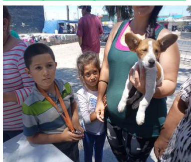
Street Clinics Before Covid19