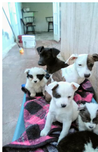
Pups Recently Dumped