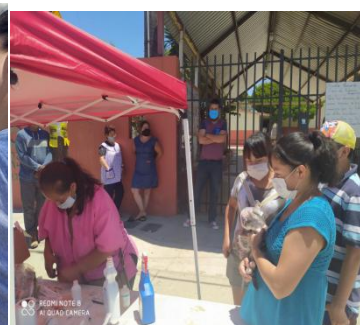
With Covid19 Protocols

Street events to treat parasites, mange, ticks, fleas and minor wounds are valuable opportunities to teach adults as well as children about general care and the importance of spay and neuter. When severe cases arrive, FHSTJ Vet Care Certificates are issued.