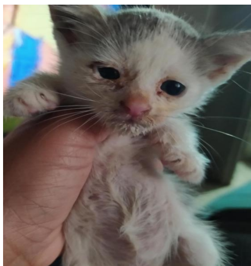
Pandy at time of rescue.

ADOPTIONS in San Diego were more than usual: 56 . it was an ideal time to give an animal a forever home since people were spending more time at home. Last but not least, RESCUES continued as before. Below is Pandy, just one of the many rescues. He was the only survivor in a litter of six found hidden in a private patio. The mother cat did not return and the owner called an FHSTJ rescuer for help. Pandy was immediately treated thanks to FHSTJ Vet Care Certificates which rescuers have on hand specifically for these types of cases.