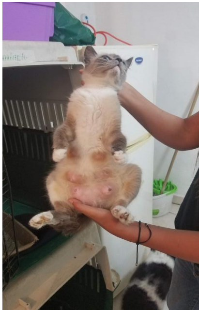
Found living on the street

Other rescuers were also working hard to help the street animals. Below is a typical case. This precious girl was found on the street with severe mastitis. Rescuers used FHSTJ Veterinary Care Certificates for her treatment and she soon recovered. She was spayed and readied for adoption.