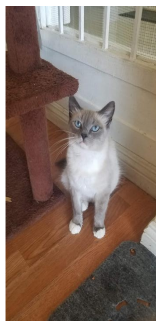
Recovered and Content