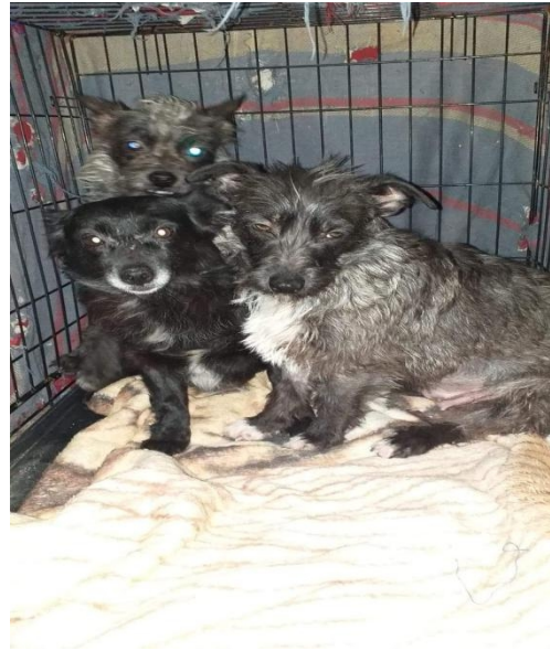
All eight were successfully evacuated.

Other rescuers were also working hard to help the street animals. Below is a typical case. This precious girl was found on the street with severe mastitis. Rescuers used FHSTJ Veterinary Care Certificates for her treatment and she soon recovered. She was spayed and readied for adoption.