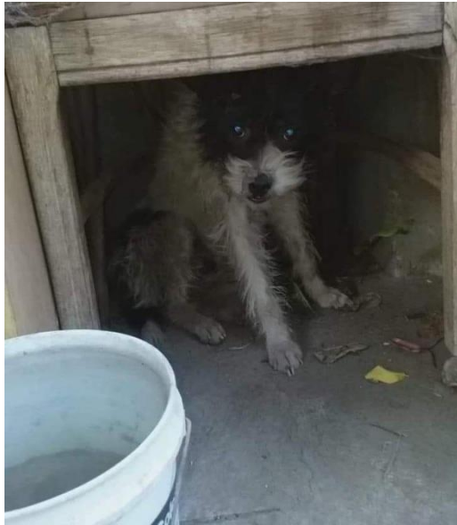
Sick and frightened. Like the eight others.